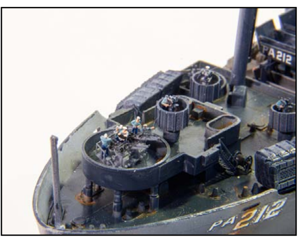
The forward 40mm quad mount on USS Montrose. The 3-D printed parts really spruce up a rather pedestrian kit.