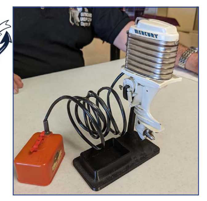
Dave Mahoney had another 1/9 scale outboard Mercury motor complete with a gas tank from 1959. This is a different outboard, as it is actually a blender for mixing drinks! The motors were available only to the Mercury Dealers, and now you know the rest of the story why Dave is always relaxed at our meetings!

Alan Welch presented a 1/376 scale model of the U.S.S. Montrose, an WWII Attack Transport he modified from an existing 1956 Revelle plastic kit. The modifications were new 3D printed details and photo etch railings. The guns, life rafts, Mk 51 gun directors, cable reels, naval crew and marines from Black Cat Models. He used 1/350 figures on the gun stations and infantry loaded inside the landing craft. Alan does extremely fantastic detailing of his models down to the rust on the hull.