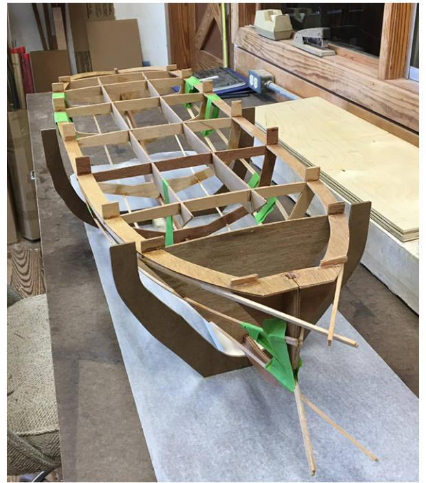
(below) The building cradle in actual use. Sometime simple is better.