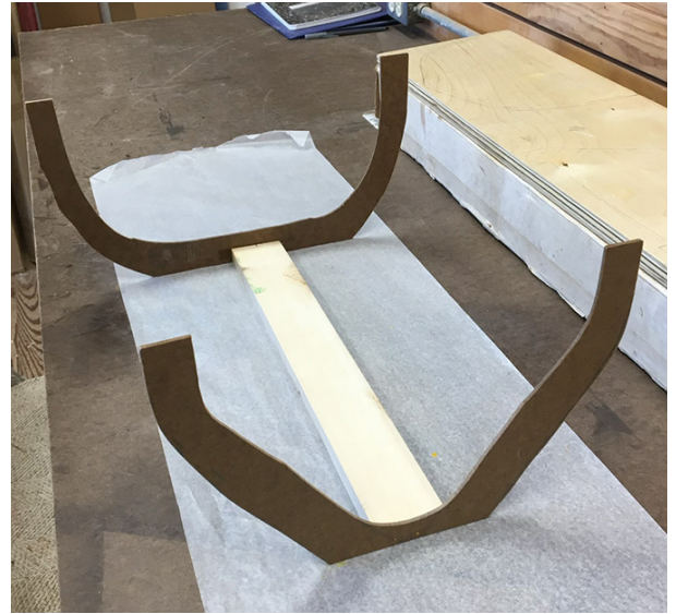
(above) Stetve Michel's simple and elegant building cradle and . . .

We will see you all at the New Bern Train Show at the end of the month.