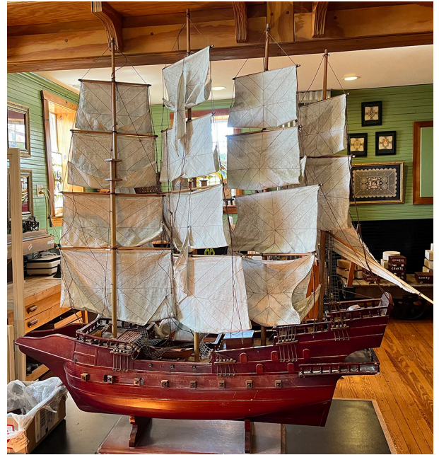
(above) Cleaning and repairing of a 15th or 16th century sailing vessel by Jim GOWER

(below) Close up of the repair and restoration of the ship by Jim. Although not an accurate "scale model" of any particular ship the size and workmanship of the project deserve our efforts in restoring it to a state to be appreciated.