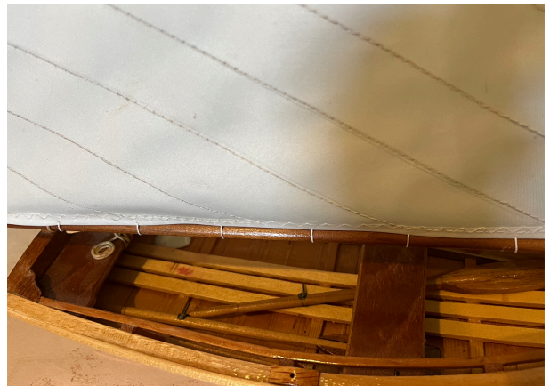
(below) Lovely interior detail of Jude’s Mail Boat